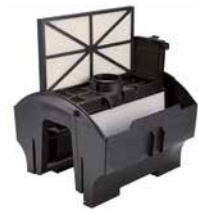
Top access to filter panel for simple maintenance.