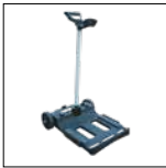
Ergonomic trolley RC97385D (included) allowing you to move and store the cleaner quickly and easily.