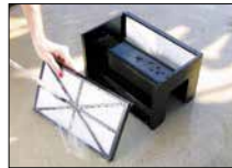
Filter panels that are easy to remove, clean and replace: RCX70101PAK2 (included).