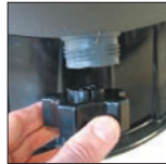
Drain with plug that also serves as a dismantling tool