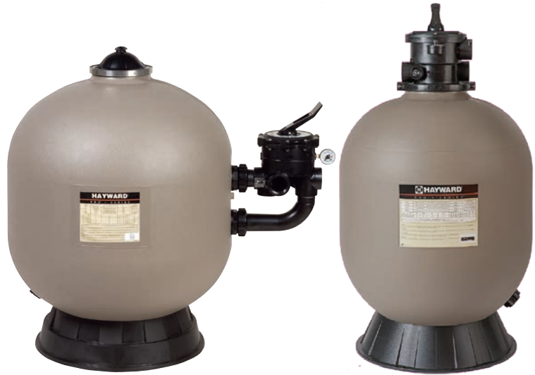
ProSeries™ HB Side