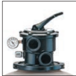
Sand easily accessible by removing the collar