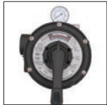
Vari-Flo™ 6-position valve